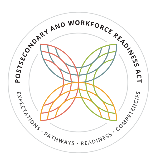
DRAFT April 2019